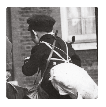
A Child's War