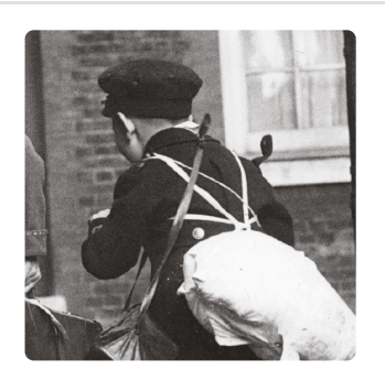
A Child's War